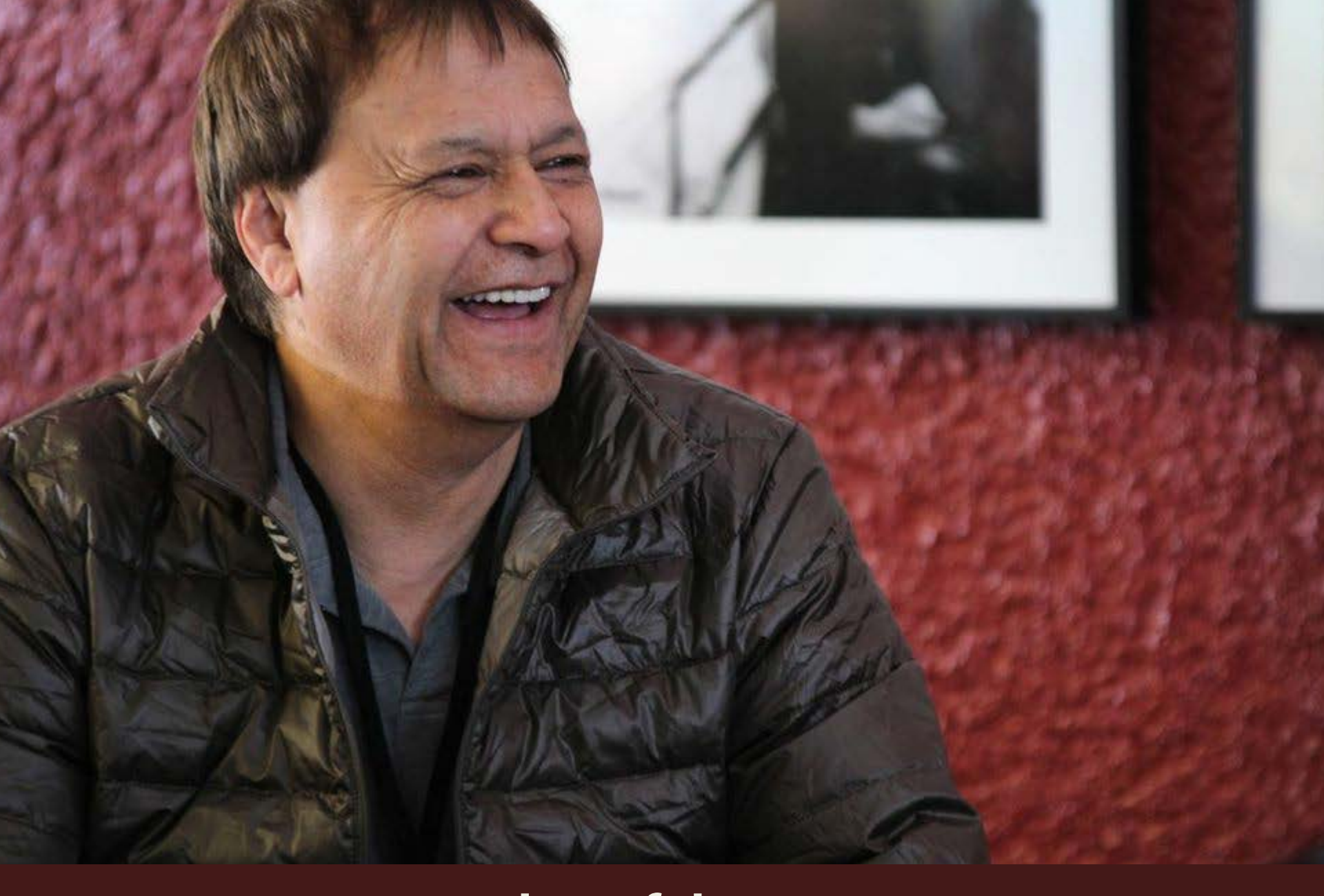
touch of humour