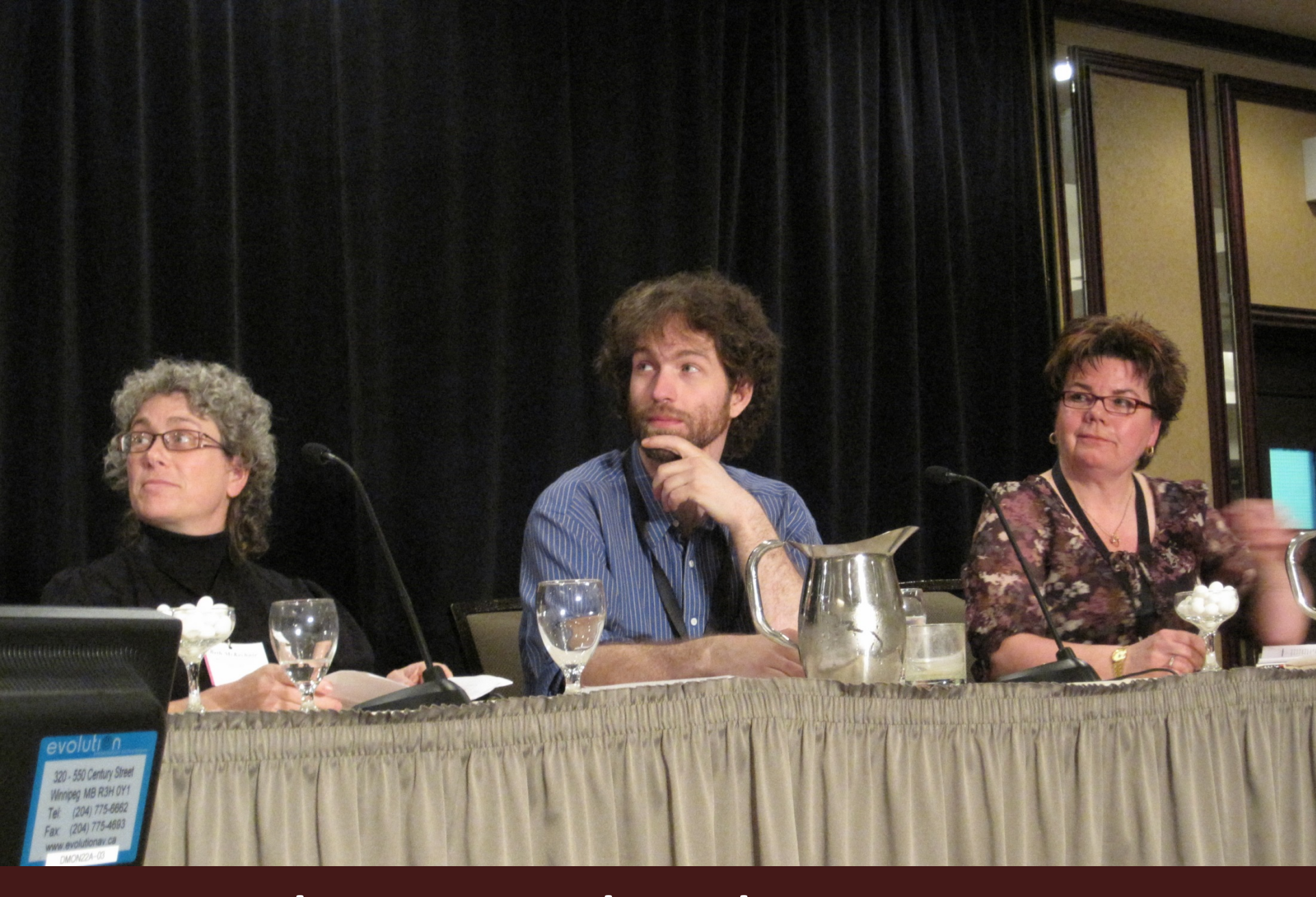
be completely present